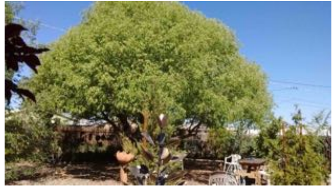
Lunch Bunch is gathering with social distance.