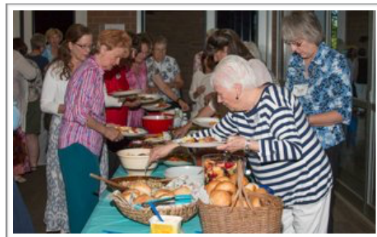
Salads and desserts were the main fare — and there was quite a variety!